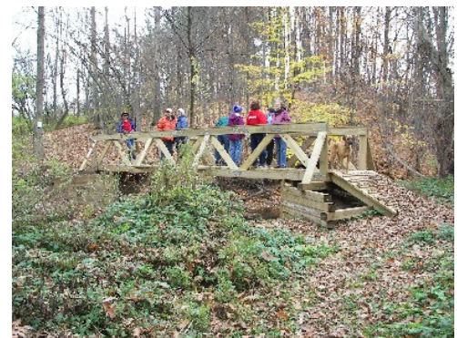
Enjoying the new bridge.