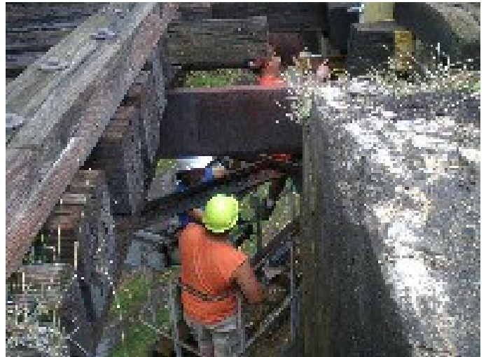
Supporting the posts at the bottom.