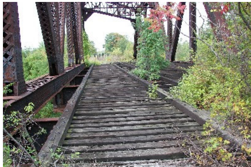
Before the start of the project.

Here are some pictures of the work involved in making the old trestle safe for hikers and bikers.