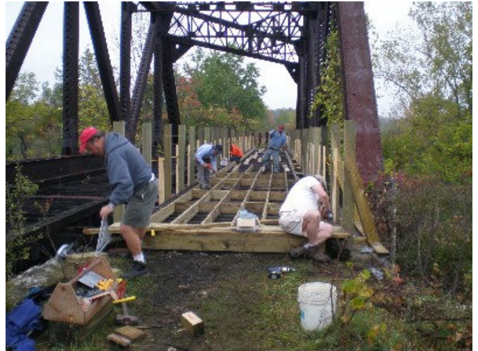
Anchoring the stringers and posts.